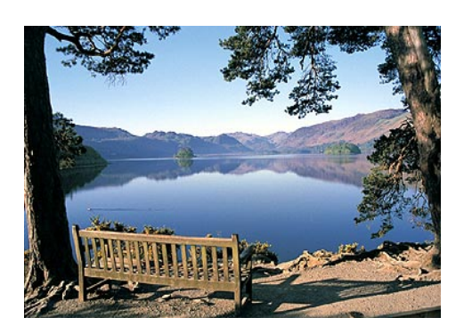
View from Friars Crag