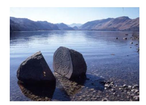
Millenium Stone, Calf Close Bay