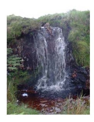
Small waterfall at top of Cat Gill

12. Cross the foot bridge and proceed south on the footpath to Ashness Bridge.