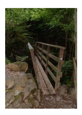
Foot bridge at base of Cat Gill